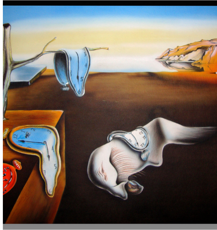
Surreal landscape with melting clocks

A pixelated portrait of Albert Einstein created by Midjourney AI.